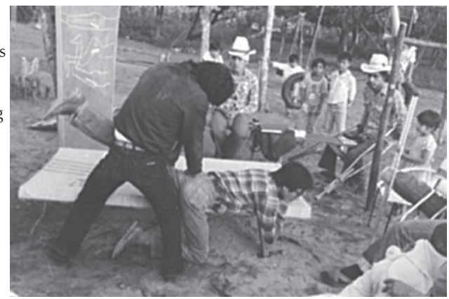
Village rehabilitation workers and family members learn in an outdoor class. Here they practice a hip-stretching exercise. Behind them, drawings on the blackboard show which muscles arc stretched.

2. Then help them LEARN BY DOING it themselves—under your guidance.