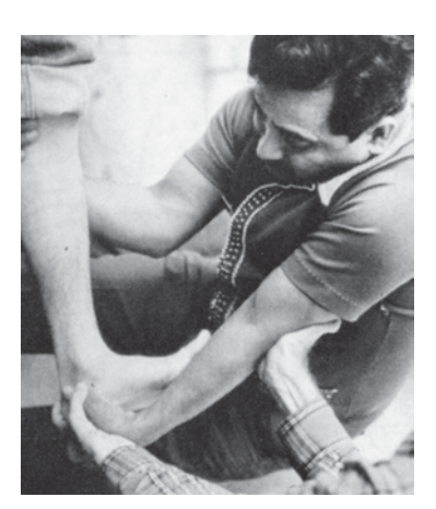
Teaching a village health worker how to stretch a tight heel cord (see p. 83.)

3. And to help them remember, give them a DRAWING or INSTRUCTION SHEET.